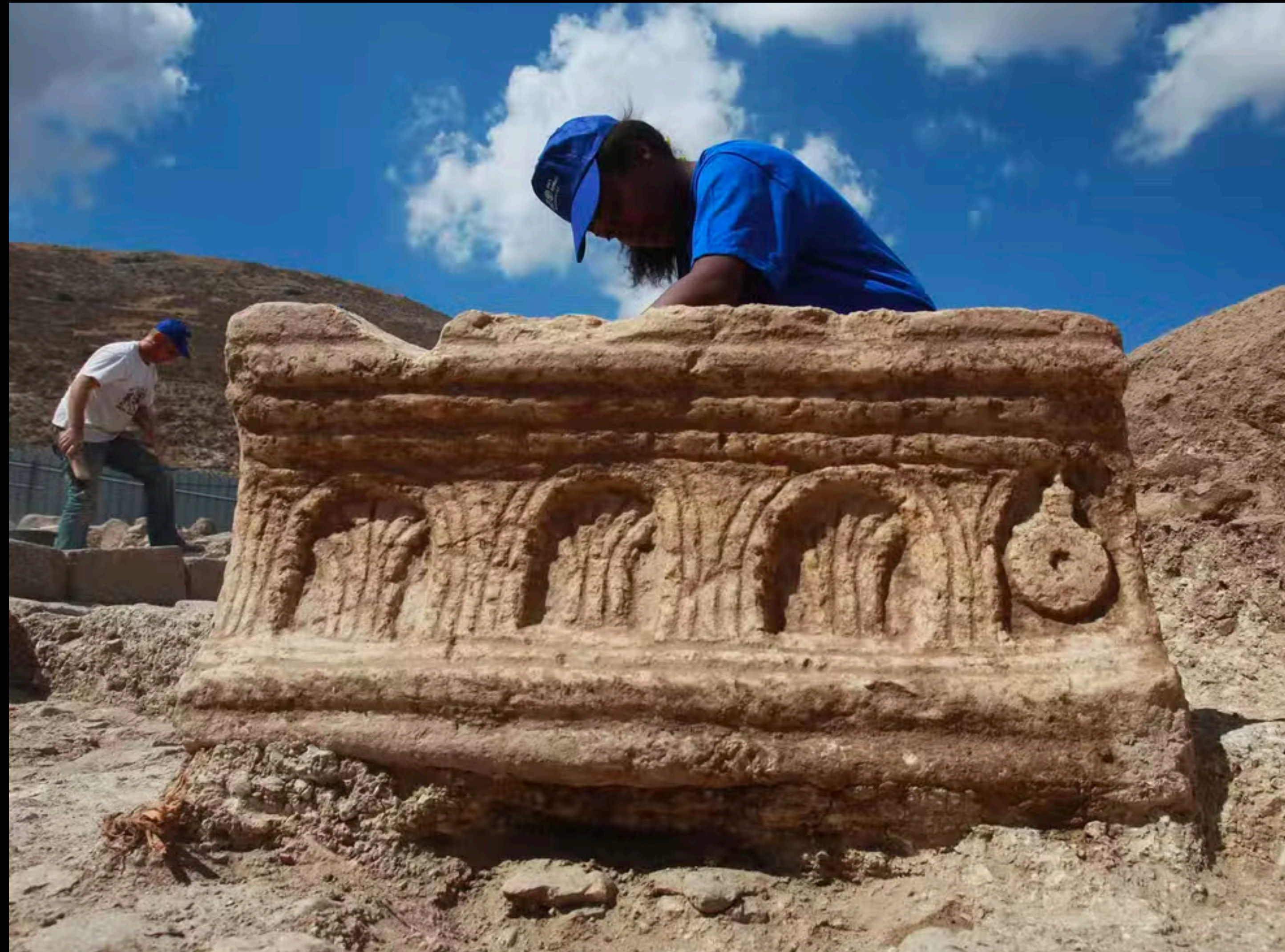
An Israeli Antiquities Authority worker cleans a large carved stone found during excavations of a recently uncovered synagogue on September 13, 2009 at Migdal on the north-western end of the Sea of Galilee in northern Israel.