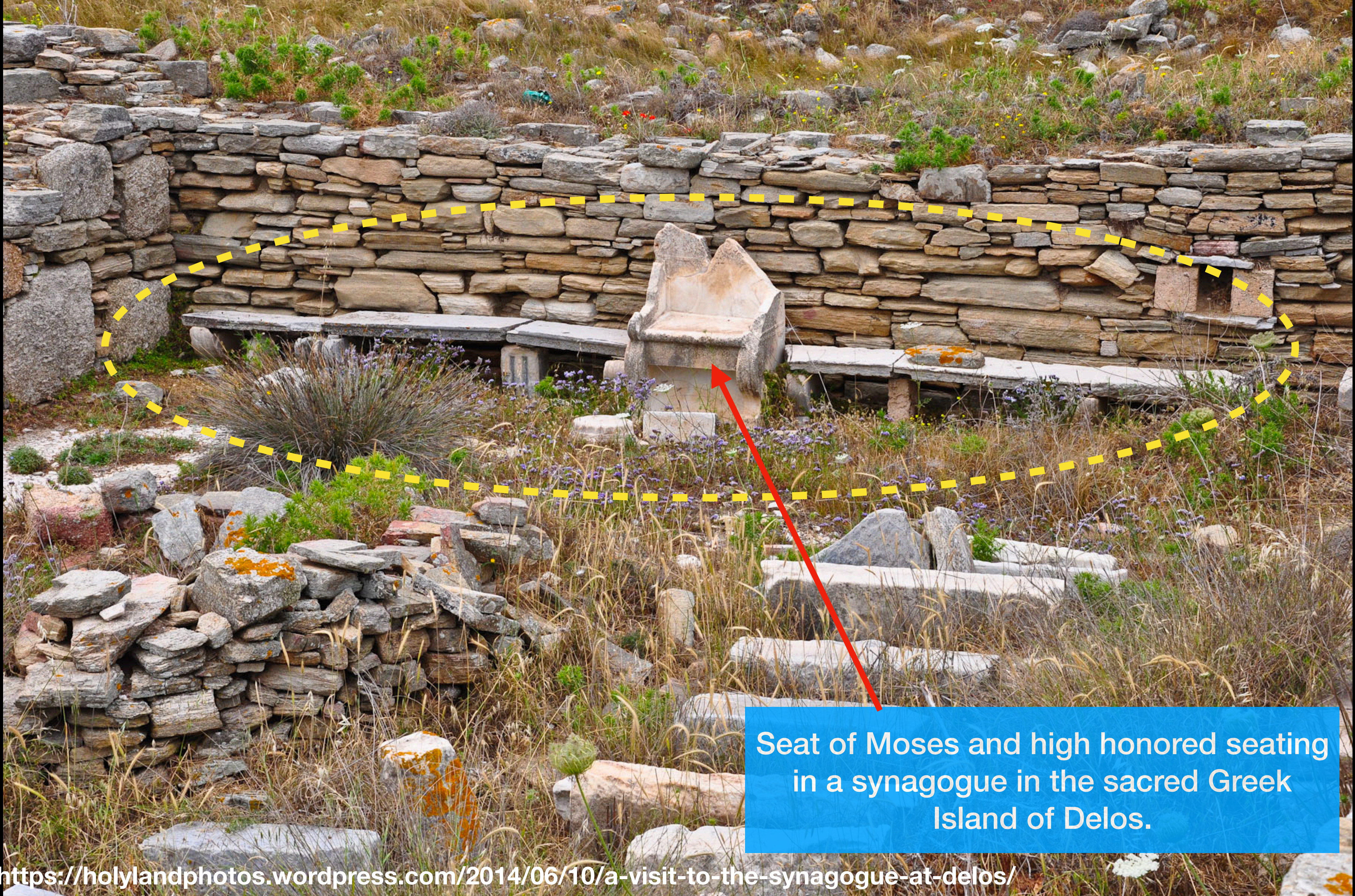
Seat of Moses and high honored seating in a synagogue in the sacred Greek Island of Delos.