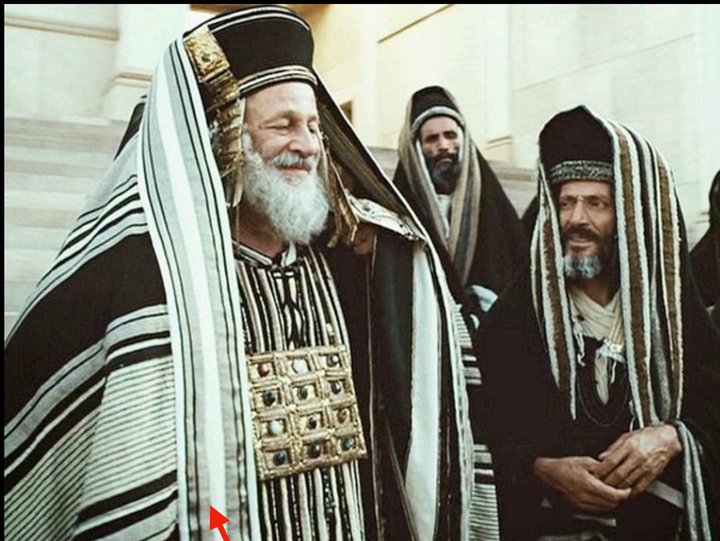
Prayer shawl “ Tallith ”