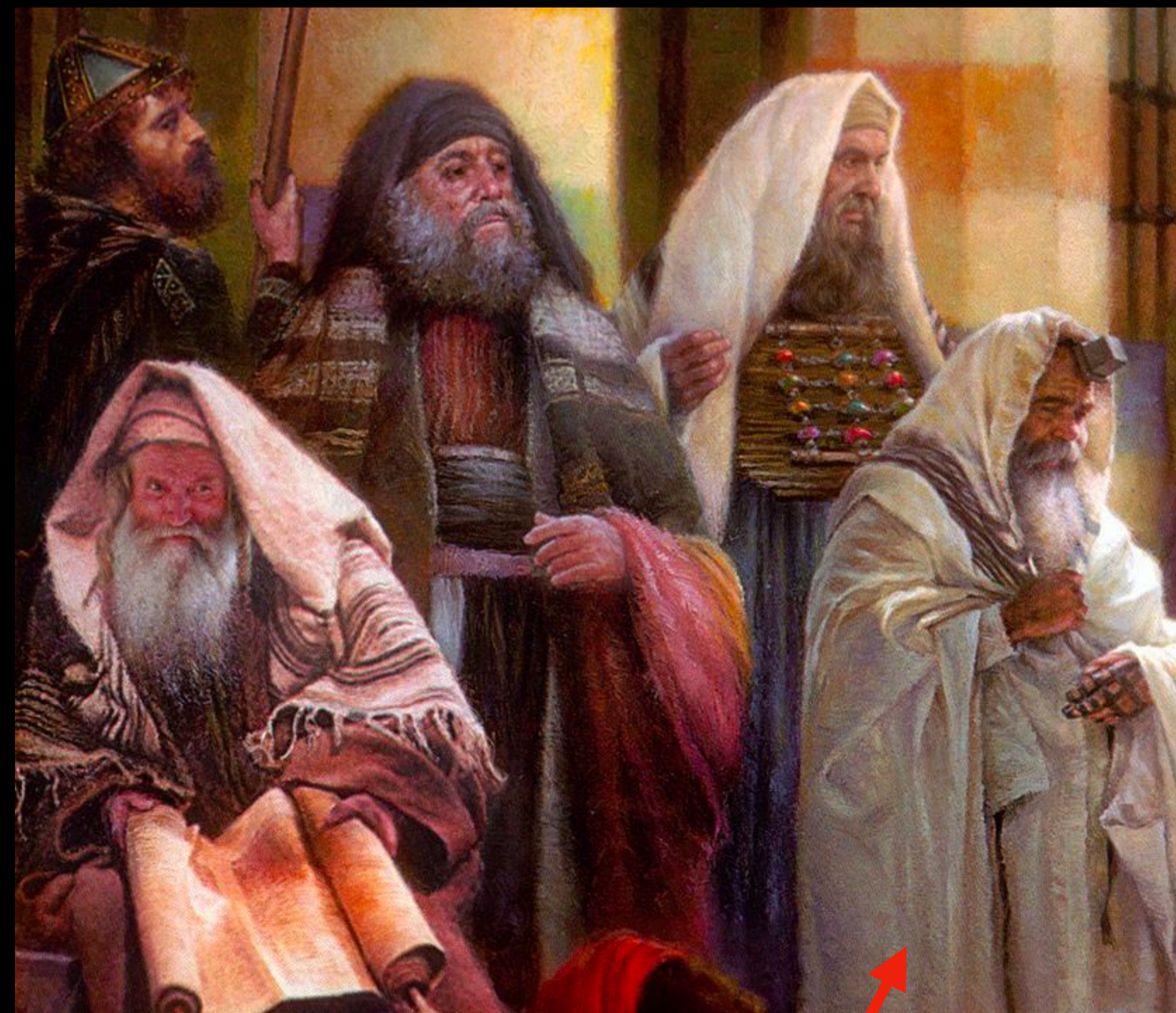
Long Flowing White Robes